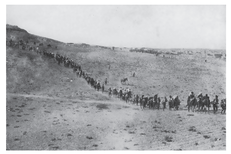
The Evacuation of 5.000 orphans from Kharpert/Harput orphanages to Syria/Lebanon, as part of the evacuation of 22.000 orphans from the Near East Relief orphanages in interior Turkey in 1922