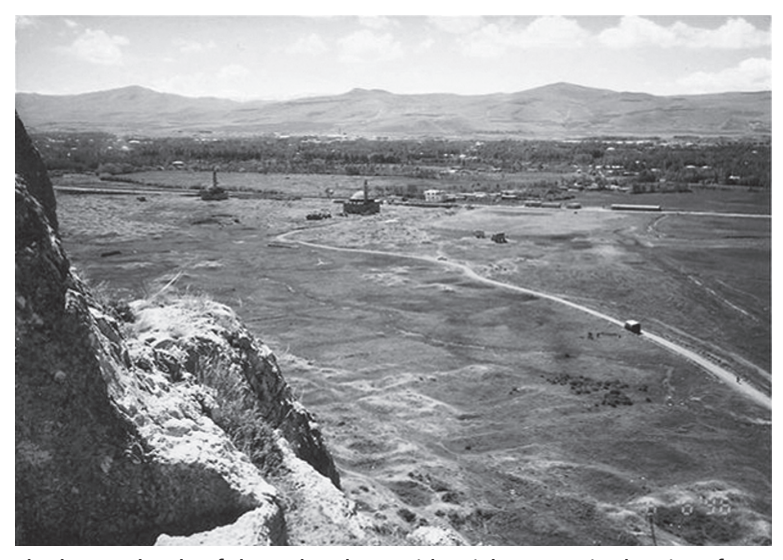
The barren lands of the Aykesdan residential quarter in the city of Van