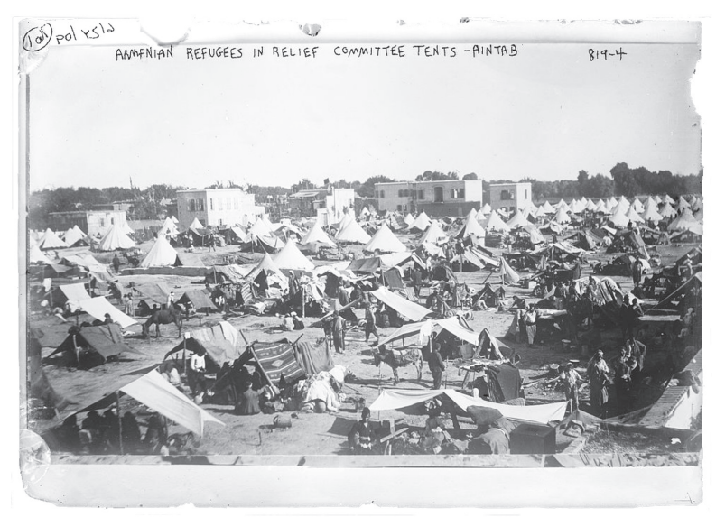
Armenian refugees in tents provided by the Near East Relief