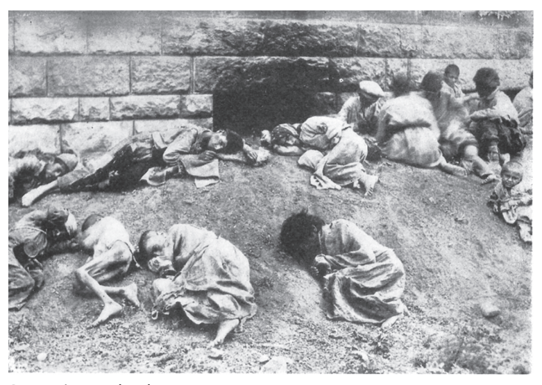
Starvation to death