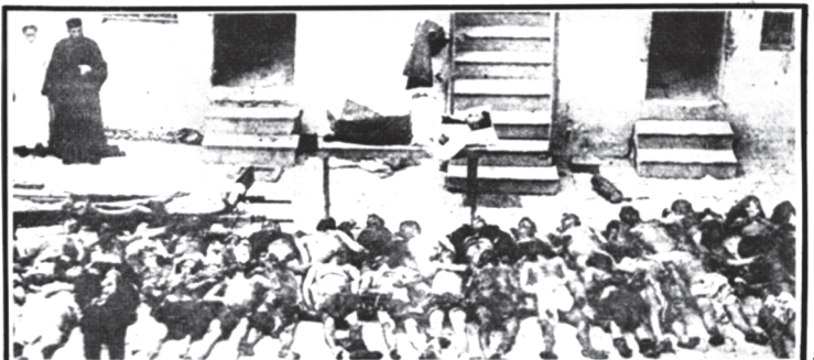
So gruesome a picture as this would be taboo in The Independent if the seriousness of the situation in Armenia now did not demand forceful illustration. These victims of a Turkish massacre typify thousands of Christian Armenians slaughtered by the Turks since the signing of the armistice.